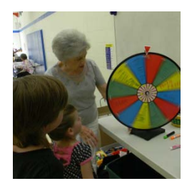
Youth Fun Night